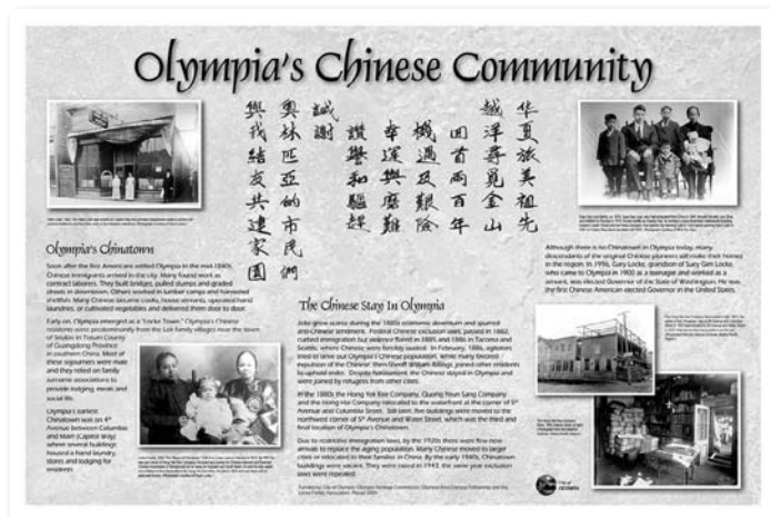
Chinese Heritage Marker installed in 2004 through the efforts of the Locke Family Association, the Olympia Area Chinese Fellowship, and the Olympia Heritage Commission.

The Heritage Commission has provided historic research and background materials to City-funded public art projects at the Park of the Seven Oars, the Olympia Custom House site and along the Yashiro International Friendship (Fourth Avenue) Bridge. The historic Emma Page Fountain, a popular feature in State-owned Sylvester Park, was also saved and rehabilitated through the efforts of the Olympia Heritage Commission, Page Family and General Administration.