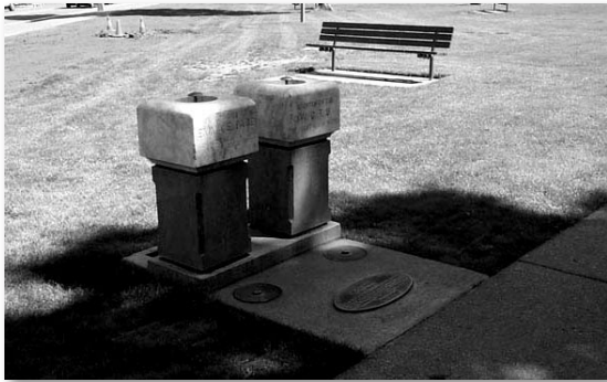
Restored Emma Page Fountain in Sylvester Park.

While there is no formal relationship between the City preservation program and the Olympia School District, City staff and volunteers provide historic walking tours for students on request. Videos and slide-tape presentations produced by the Heritage Commission are made available to area teachers through Education Service District 113. In 1996 staff also produced a curriculum guide for Olympia’s historic Bigelow House Museum using the National Park Service model for “Teaching With Historic Places.”